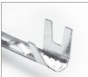
RCA Cable Clamp - M-Series, Cable O.D 3mm to 6.5mm (0.118" to 0.256")